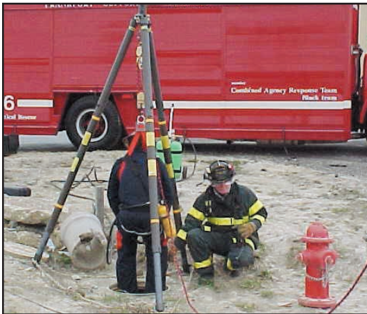
Tripod Conversion Kit